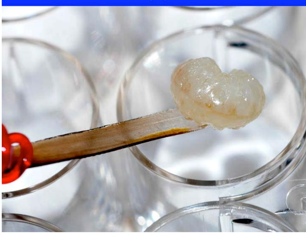
Fig. 4. A newly enclosed adult worker in a cell from pupation plate. Adult bee closeup

Fig. 3. Transfer of mature larva for pupation, using a modified grafting tool. Transferred to paper-lined cells