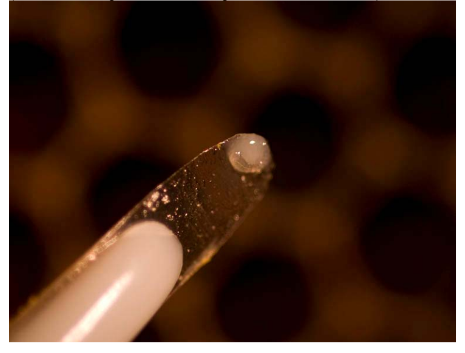
Fig. 2. Uric acid crystals and fiber-ish material from larval defecation

Fig. 1. Grafting a first day larva using the Chinese larval grafting tool (the faint hexagons in the background are brood cells).