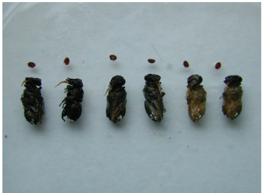
Fig. 3. Sterile mites with defecation on bee abdomen. All these six mites did not reproduce and all had defecated on the Apis cerana workers. This is also true in Apis mellifera : if a mite has defecated on the pupae, she would have no daughters. If she has daughter mites, she would be defecating on the wall.

Sharpies also, because bees may seal the small holes with wax, and you lose the reference. 3). Open the cell slightly using a fine scalpel, an insect pin, or a pair of fine forceps, and introduce a mite carefully into the small slit using a horse hair or a fine brush. 4). Push the wax capping back, and seal it with melted beeswax with a brush. 5). Keep the frame upright at all times, and the relative humidity at 50%, and at a temperature of 32-35 °C. 6). Check the frame daily for signs of wax moth larvae, because they can