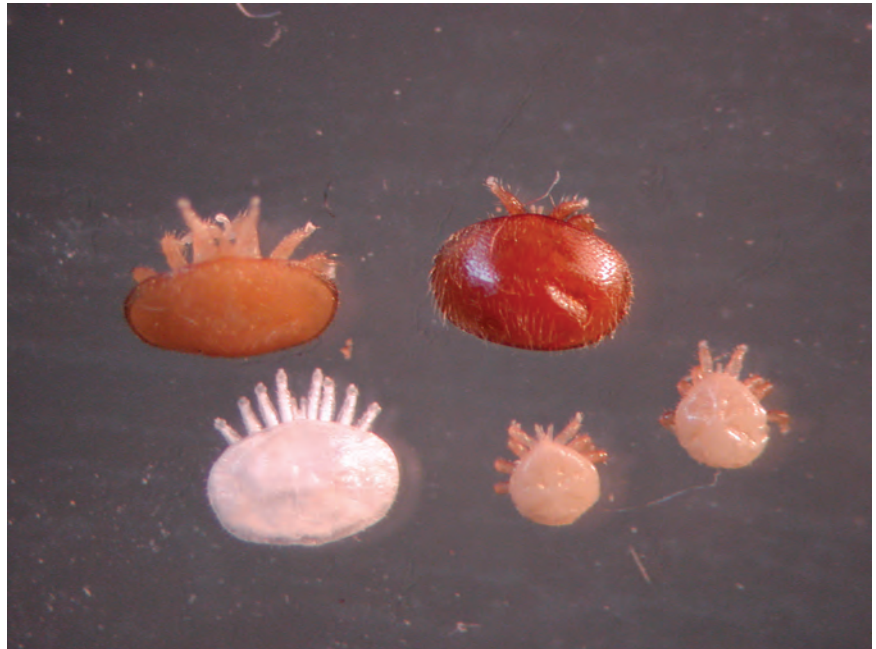
Fig. 2. Mature, immature females and mature males of Varroa. Clockwise from top left: mature daughter mite, mother mite, two mature males and an immature (deutonymph) daughter. A younger stage (protonymph) of female is not in this photo.

There are two methods for studying mite reproduction. One method is simply to survey, uncapping worker or drone cells in colonies and determining the percentage of mites that reproduced (fertility), or the number of offspring (fecundity) of mites. This method gives information about what is happening under natural conditions, but the information one gets is limited because nothing is controlled or manipulated. Another method is to perform manipulations, either on the mites or on the host, then artificially introduce mites into the cells and wait 9-10 days to determine fertility and fecundity. The frames can be reintroduced into a colony (which risks removal by bees due to hygienic behavior), or incubated in a laboratory. The basic steps for this process are as follows. 1). Harvest mites either from brood cells or from phoretic hosts in a colony with a high number of mites. We now routinely harvest mites using the sugar dusting method, and then clean the sugar off them using a moistened brush. 2). Obtain brood cells that are recently capped (within 6 hours). This should be from a colony with no mites, so that you do not have natural invasion into the cells that you are trying to introduce mites to—if you have two mites in one cell, you do not know which one is the introduced one. Mites will not reproduce if